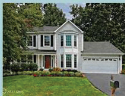
13910 Marblestone Drive