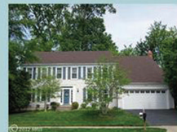
13664 Union Village Circle