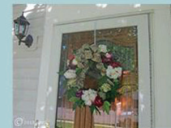
6304 Sandstone Way

Please Contact Karen for a FREE No-Obligation Market Analysis of your Home