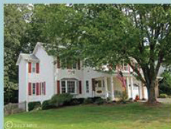
6571 Rockland Drive

*MRIS Database March 10, 2013 Detached Homes