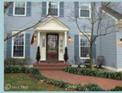
13703 Springstone Court