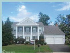
13504 Battlewood Court