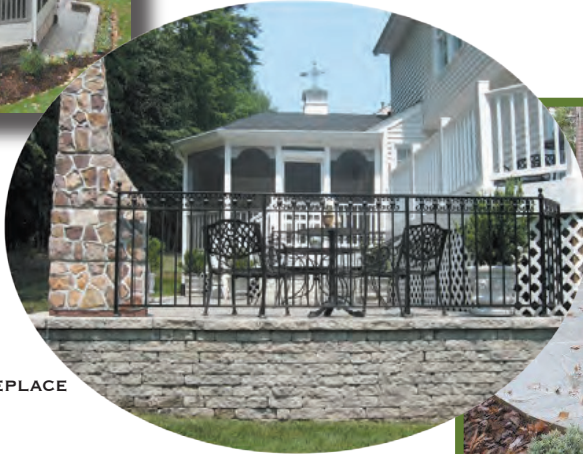
CUSTOM OUTDOOR FIREPLACE