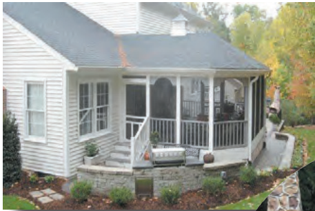
SCREEN PORCH WITH WRAP AROUND PATIO

Specializing in the installation of decks, porches, patios & additions!