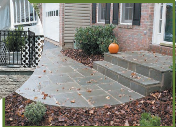
CUSTOM FLAGSTONE VENEER OVER EXISTING CONCRETE STOOP ...AND WALKWAYS