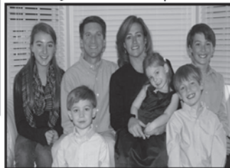
The Zampiello Family